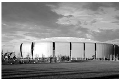
University of Phoenix Stadium

Super Bowl XLII will be played at the new University of Phoenix Stadium on Sunday, February 3, 2008. The question is how will this affect Scottsdale Camelback Resort owners?